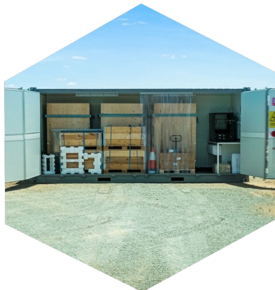
Figure 1: Orexplore self-sustained containerised unit with 3 x GeoCore X10® units

Key terms of the agreement include the delivery of site-based drill-core scanning and analysis services of approximately 2,000m of NQ core over a period of approximately two months. The Agreement is exclusive for both parties. Other terms are customary for agreements of this nature.